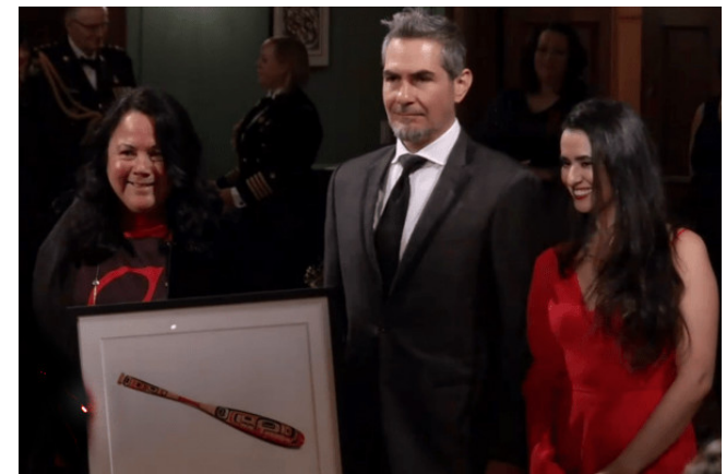
xaʔqanaʔ ʔitkiniʔ (Many Ways of Doing the Same Thing) Research Team presented with a BC Reconciliation Award.