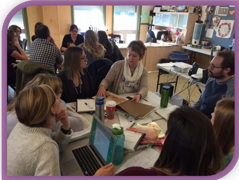
Photo: 2 Communities of Pedagogical Inquiry: A Collaborative Cross-institutional k-20+ Learning Partnership: Learning Along-side and Transforming Education.