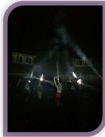
Photo: 1 FCCS Student performance.